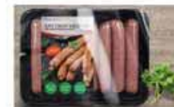
FOOD &amp; BEVERAGE