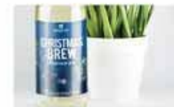
SEASONAL &amp; PROMOTION